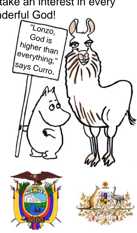
Emblems of Ecuador and Australia

Make an emblem for yourself. Write your name at the bottom and then draw things that are important to you. Eg. family, pets, sports, hobbies.